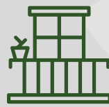
Large ventilated balconies