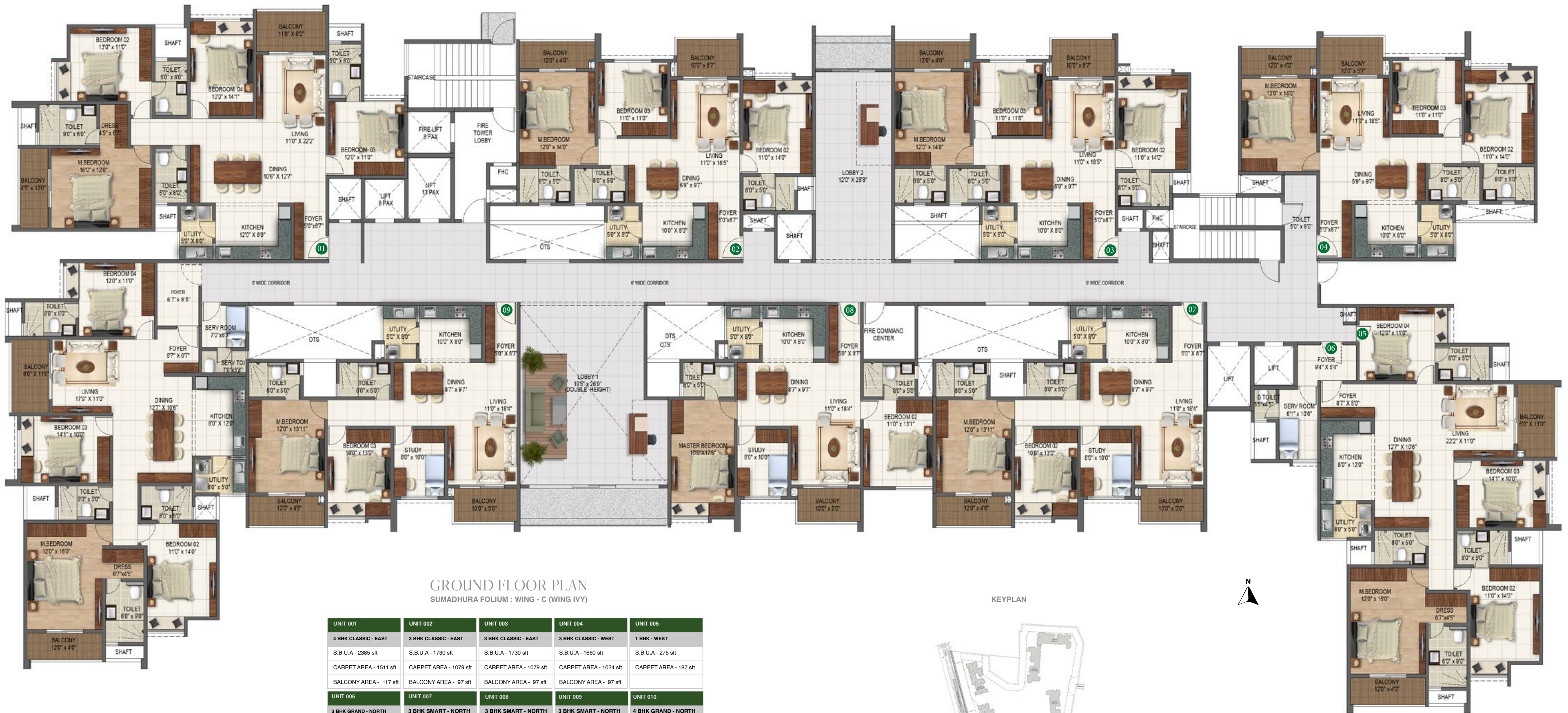
GROUND FLOOR PLAN SUMADHURA FOLIUM : WING - C (WING IVY)