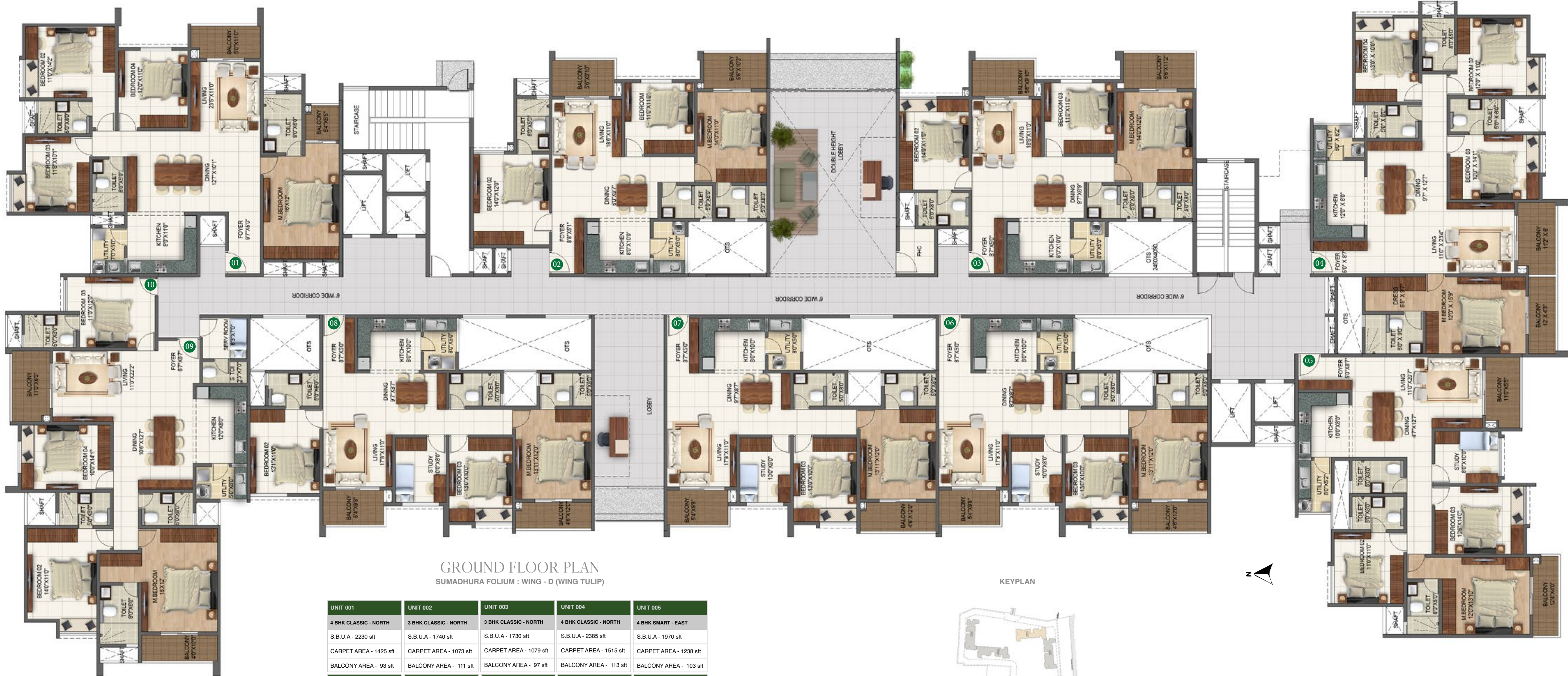
GROUND FLOOR PLAN SUMADHURA FOLIUM : WING - D (WING TULIP)