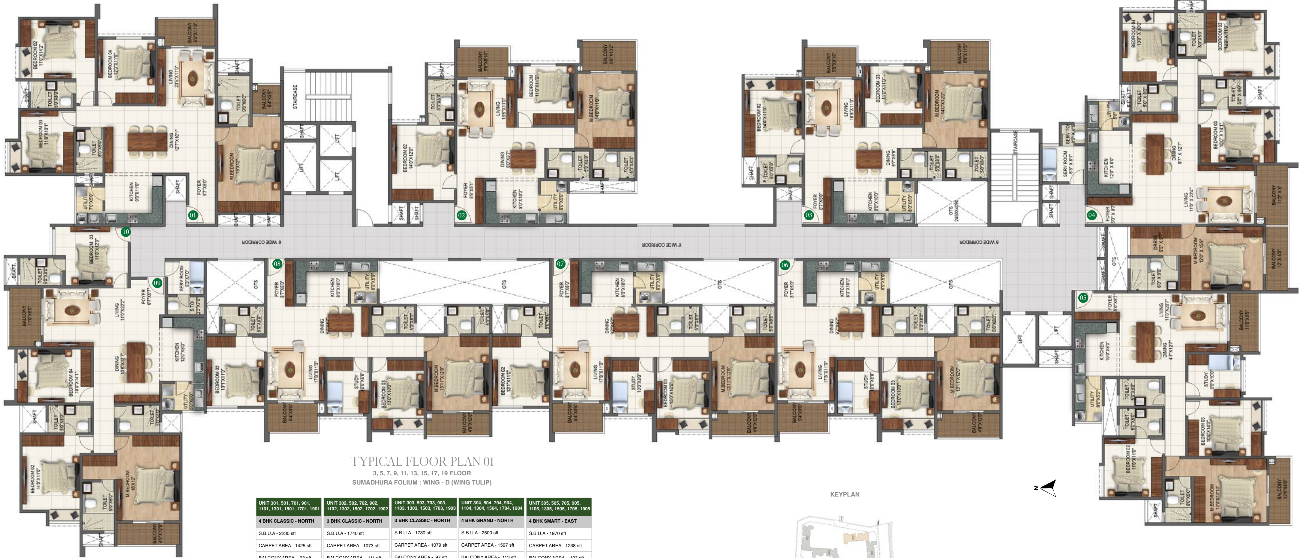
TYPICAL FLOOR PLAN 01 3, 5, 7, 9, 11, 13, 15, 17, 19 FLOOR SUMADHURA FOLIUM : WING - D (WING TULIP)