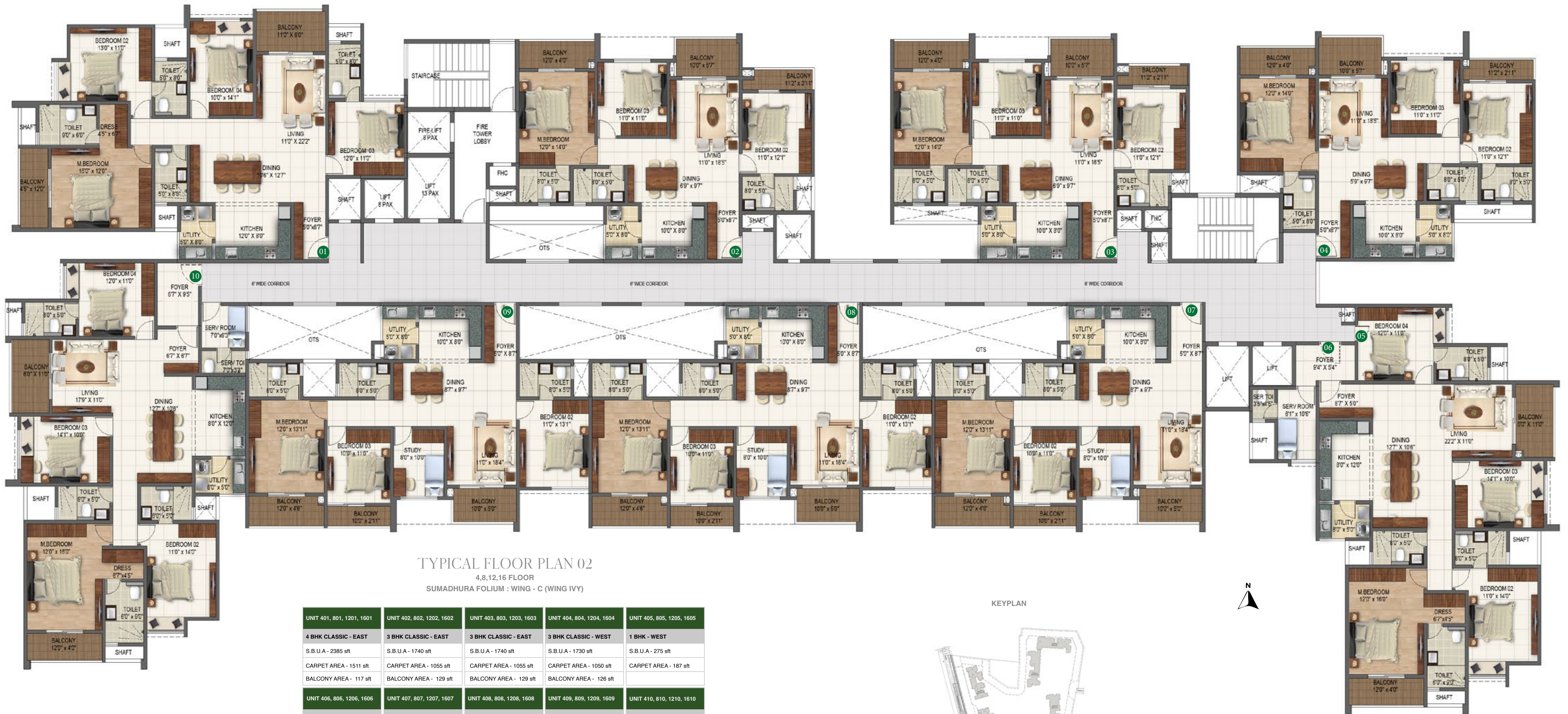
TYPICAL FLOOR PLAN 02 4,8,12,16 FLOOR SUMADHURA FOLIUM : WING - C (WING IVY)